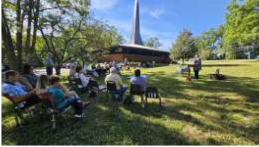
Joint Outdoor Worship and Picnic at Hope Lutheran 9/15/24