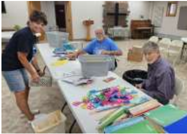
Assembling & Packing LWR Kits